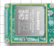
50*40mm (pin to pin with K705)