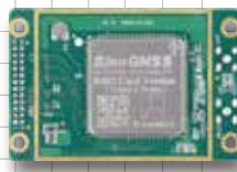
46*71 mm (pin to pin with K706)